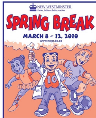
Spring Break Brochure